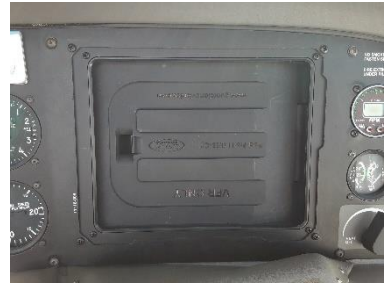
Figure 6 Guardian Mount into which iPad Pro fits and connects to power.

The same thing for glare, no problems yet, although if it becomes a problem I am prepared to apply a glare shield cover to the iPad if and when the problem arises.