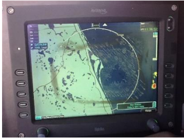
Figure 1 Avidyne with early screen "burnout" – later followed by black.

I'm an "old-timer" and so is my 2002 Cirrus SR20. I'm on my second engine and considering everything that has transpired I've been a happy camper these past seventeen years. Well, you can add one exception to that " happy camper " moniker – the frustrations I began encountering a couple of years ago when my Avidyne 5000 MFD first started going south.