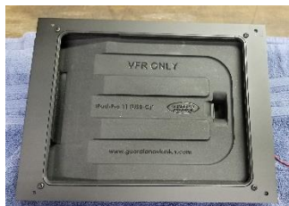
Figure 3 Guardian Mount into which iPad slides.

Equally important, I wanted the new installation to look as professional as it could, and I wanted the gaping hole that would be left by the removal of the Avidyne to be covered completely.