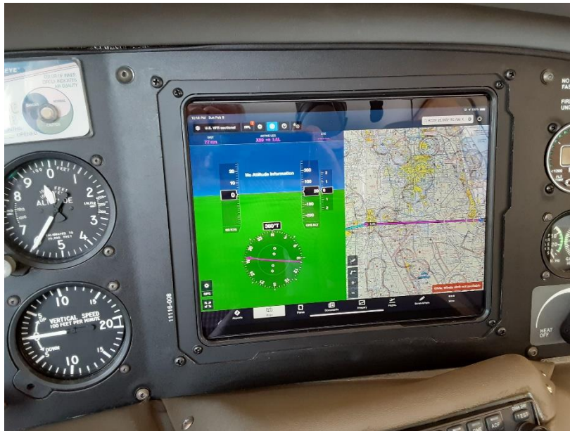
Figure 2 New Guardian Avionics panel mount with slide-in iPad 11" Pro

I had resigned myself to either looking at a black screen if I left the Avidyne in place, or a black hole in my panel (if I removed the Avidyne), until one day, while leafing through an aviation publication, I came across what I thought might be the perfect solution to my Avidyne problem.